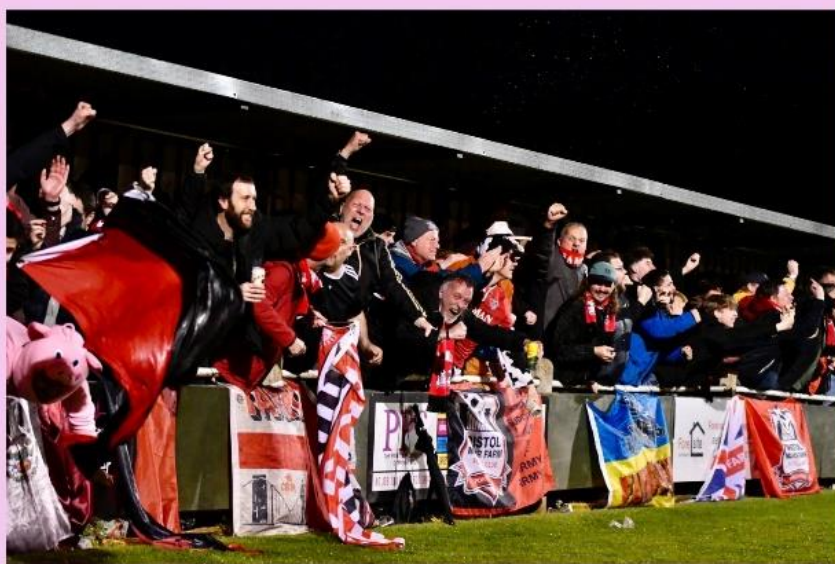
FARMY ARMY | The Bristol Manor Farm fans are amongst the most vocal in the Southern League

“The only downside for me is that I don’t get as much scarecrow time relaxing in my fields, but that is a small sacrifice for our great community club!”